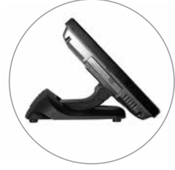
Low Profile Mode