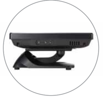
Flat Folded Mode