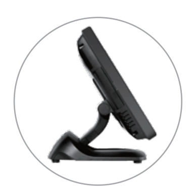
Full Extended Mode

The XT-6015C provides the selection of two foldable bases, the curvy slim GEN7E base and the larger but practical GEN8E base. The foldable base can be configured into "Flat Folded Mode" to save the shipping package volume, "Low Profile Mode" to allow greater interaction between the cashier and the customer, and the traditional "Full Extended Mode". All this can be achieved with a simple pull of the hidden lever.