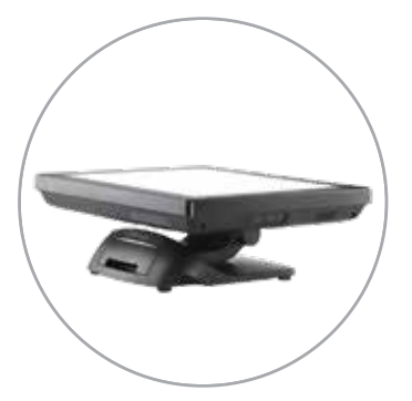
Flat Folded Mode