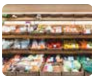
Daily /super/hyper store