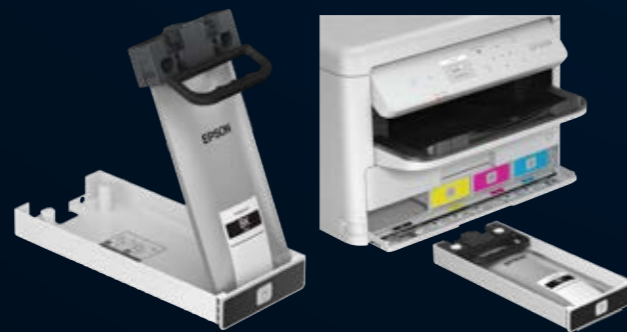
Designed for easy replacement of ink packs

In addition, Epson's DURABrite™ Ultra ink delivers laser-like quality prints that are water- and smudge-resistant.